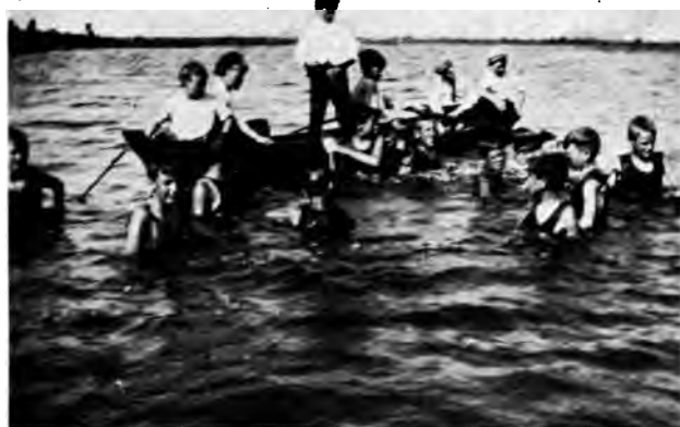
THE LURE OF THE WATER